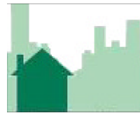
Erie Weed and Seed